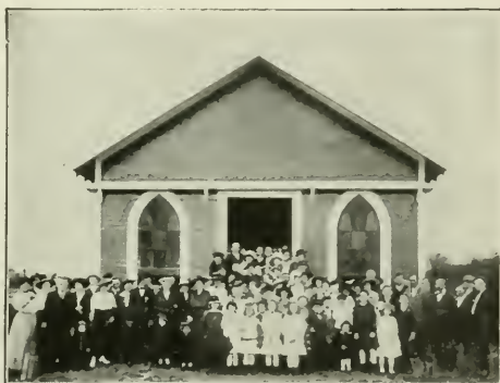
KENNER, LA. (Church)